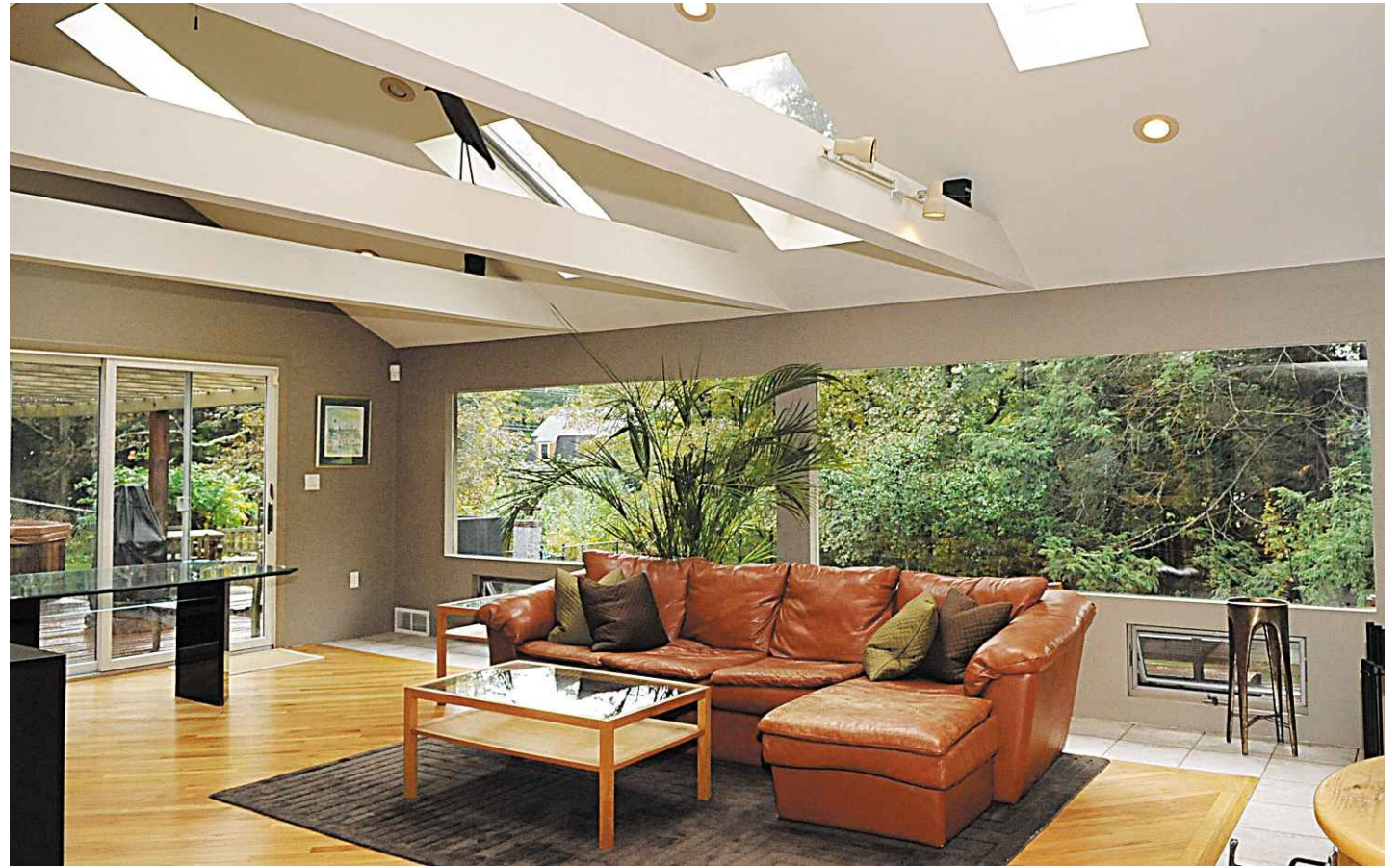
LISA POOLE FOR THE BOSTON GLOBE