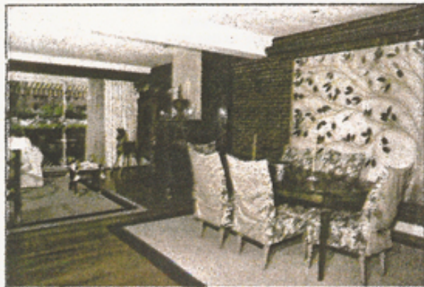
A white beamed ceiling and a mirrored wall brighten the dining area in Townhouse 12 that features exposed brick and hardwood flooring.