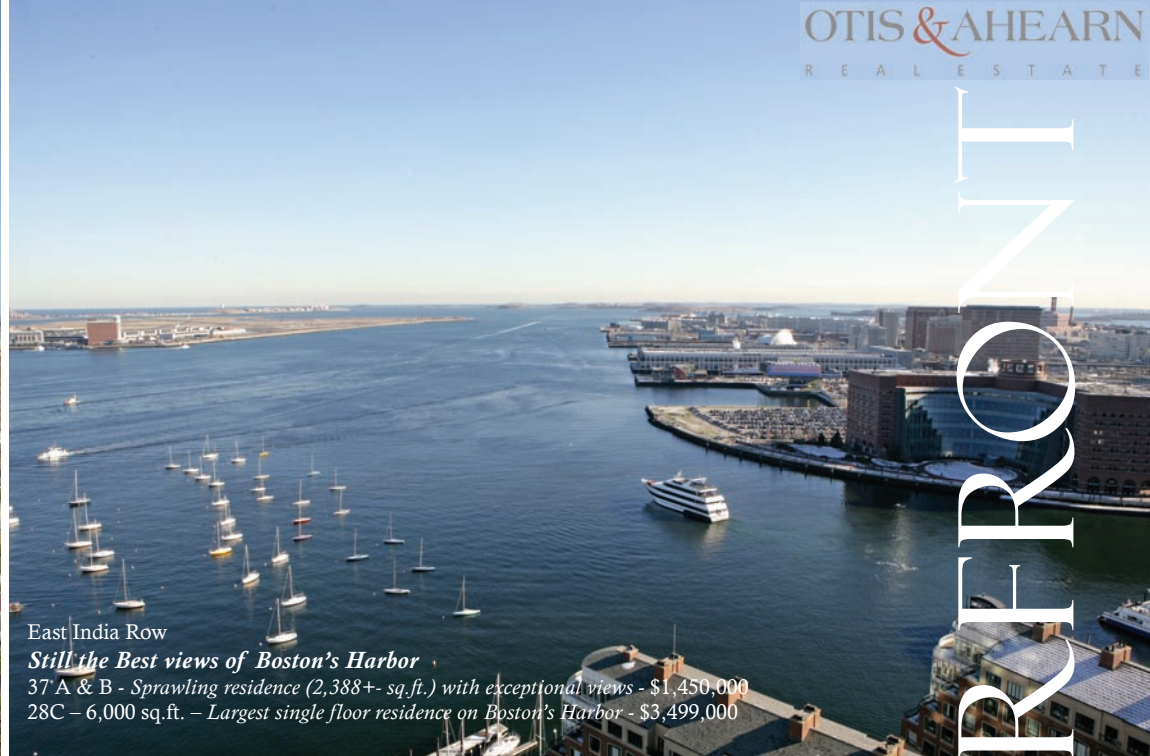
East India Row Still the Best views of Boston's Harbor 37 A & B - Sprawling residence (2,388+ sq.ft.) with exceptional views - $1,450,000 28C - 6,000 sq.ft. - Largest single floor residence on Boston's Harbor - $3,499,000