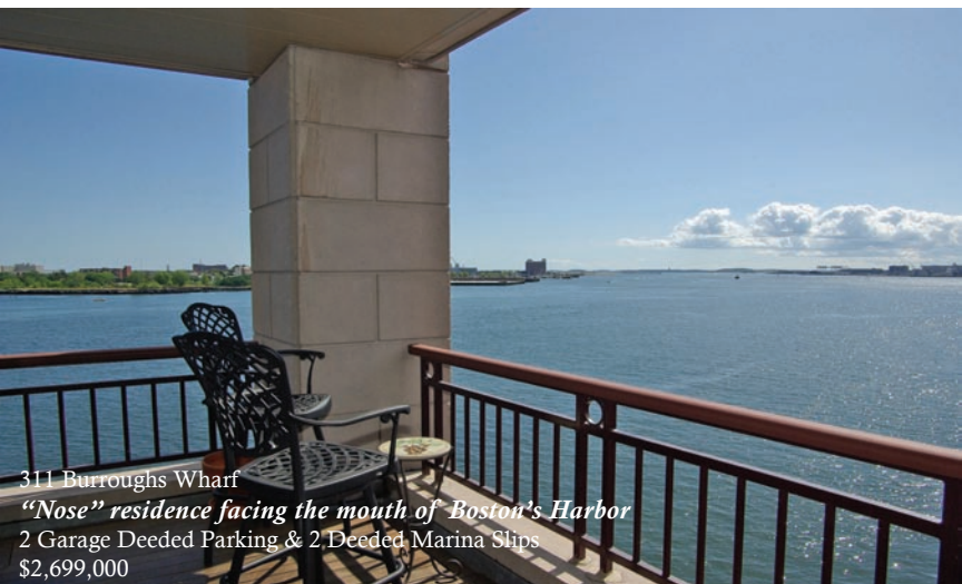
311 Burroughs Wharf "Nose" residence facing the mouth of Boston's Harbor 2 Garage Deeded Parking & 2 Deeded Marina Slips $2,699,000