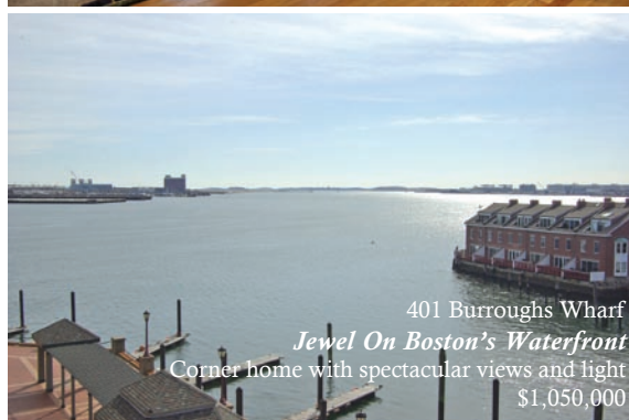
401 Burroughs Wharf Jewel On Boston's Waterfront Corner home with spectacular views and light $1,050,000