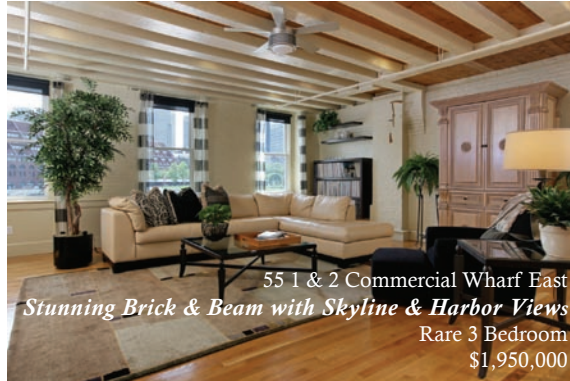
55 1 & 2 Commercial Wharf East Stunning Brick & Beam with Skyline & Harbor Views Rare 3 Bedroom $1,950,000