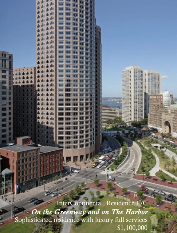
InterContinental, Residence 17C On the Greenway and on The Harbor Sophisticated residence with luxury full services $1,100,000