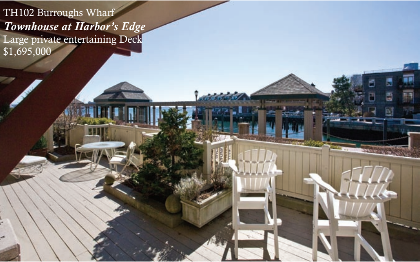
TH102 Burroughs Wharf Townhouse at Harbor's Edge Large private entertaining Deck $1,695,000