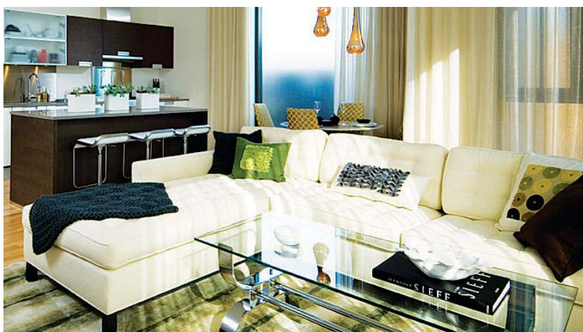
An open plan shows the relationship between kitchen, dining, and living space in an FP3 residence.