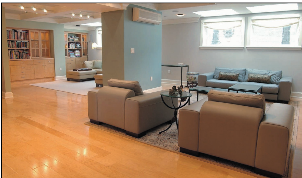
The living room is simply enormous, as the owners combined two spaces. One area is used for entertaining while the other half serves as a family room, which extends into a sitting room.