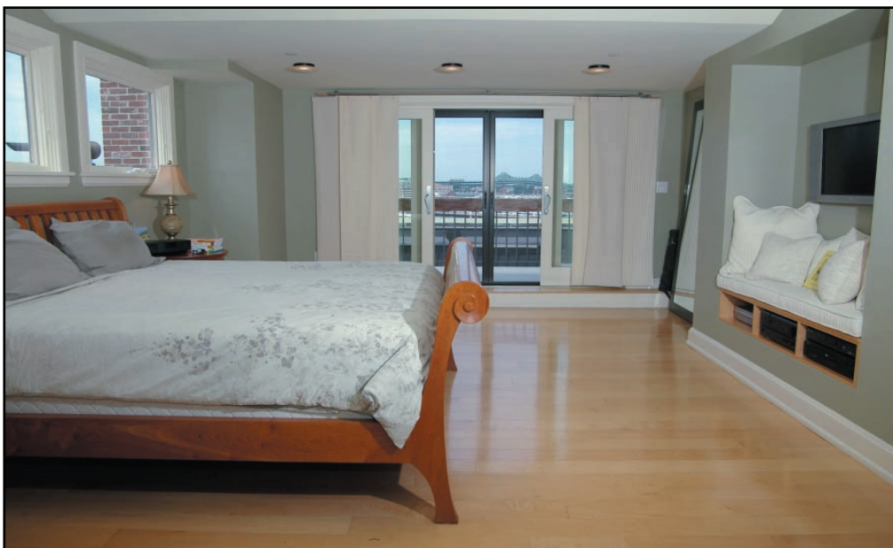
The master bedroom suite has glass sliders that open onto a long deck. Opposite the bed is a built-in seating area, above which is a plasma TV.