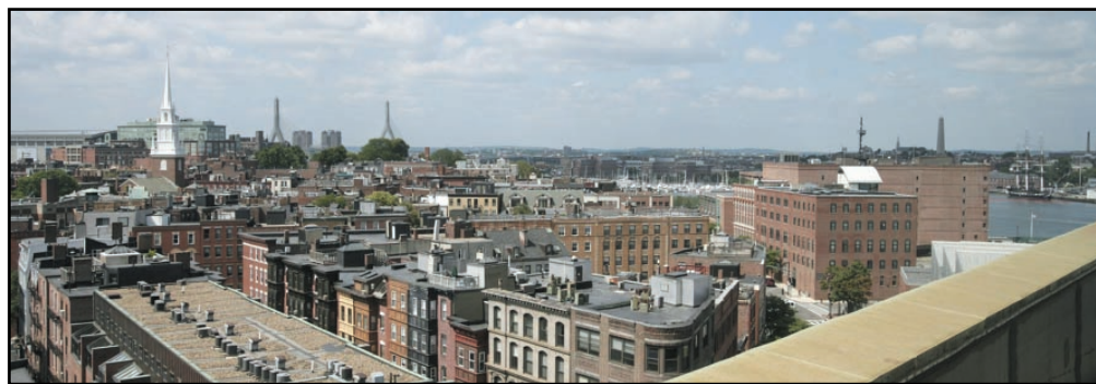
Sweeping views of the North End and beyond, including the Leonard Zakim Bunker Hill Bridge, are among the vistas enjoyed from the decks of this penthouse, Unit 802-803, at Lincoln Wharf, 379 Commercial St.

The first steps into the unit are through a dramatic entryway in deep red. A coat closet makes guests feel welcome. Come up a maple staircase into the kitchen, the focal point of the place. It is filled with light streaming through windows, sliders and skylights, bouncing off the hardwood floors. Since both homeowners are cooks, they created a gourmet kitchen with cherry and glass cabinetry, a stainless-steel tiled backsplash with brilliantly colored glass accents and honed granite counter and breakfast bar. The appliances are top-of-the-line, including a Wolf ceramic cooktop, Firenze Zephyr range